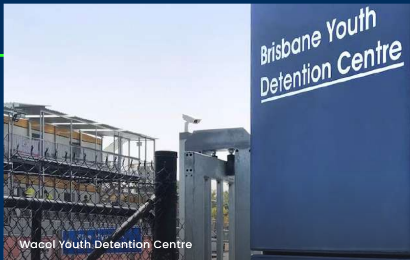
Wacol Youth Detention Centre

We are a trusted government contractor, having completed major infrastructure projects, including the Commonwealth Games Village and venues, Millenium Arts Project, Wacol New South Detention Centre and Roma Street Parklands.