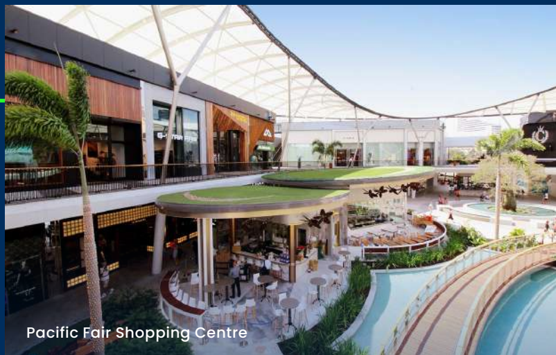
Pacific Fair Shopping Centre

Our retail expertise spans decades, having completed major projects such as Pacific Fair, Sunshine Plaza, Robina Town Centre and countless individual stores.