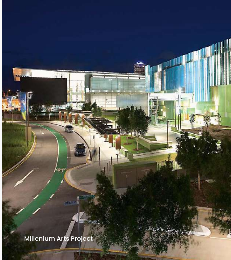
Millennium Arts Project

We put our customers first, whether a single shop-owner or large multi-res developer, endeavoring to offer the best electrical solutions for your project across value, sustainability and longevity.