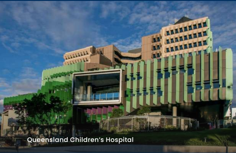
Queensland Children's Hospital