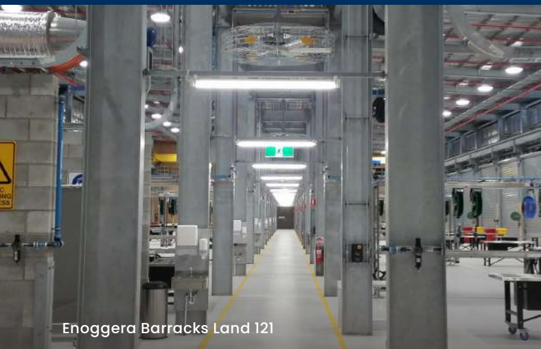
Enoggera Barracks Land 121

We know transport, with a long list of successful projects to our name, including the Gold Coast Airport Expansion, Brisbane Airport and even train stations.